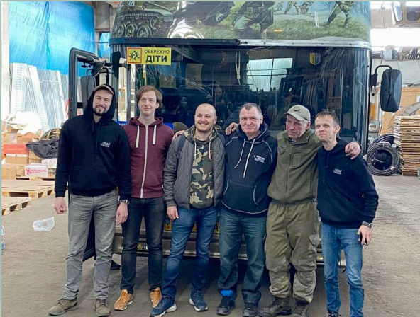
Our TC from the Kniazze with a blessing